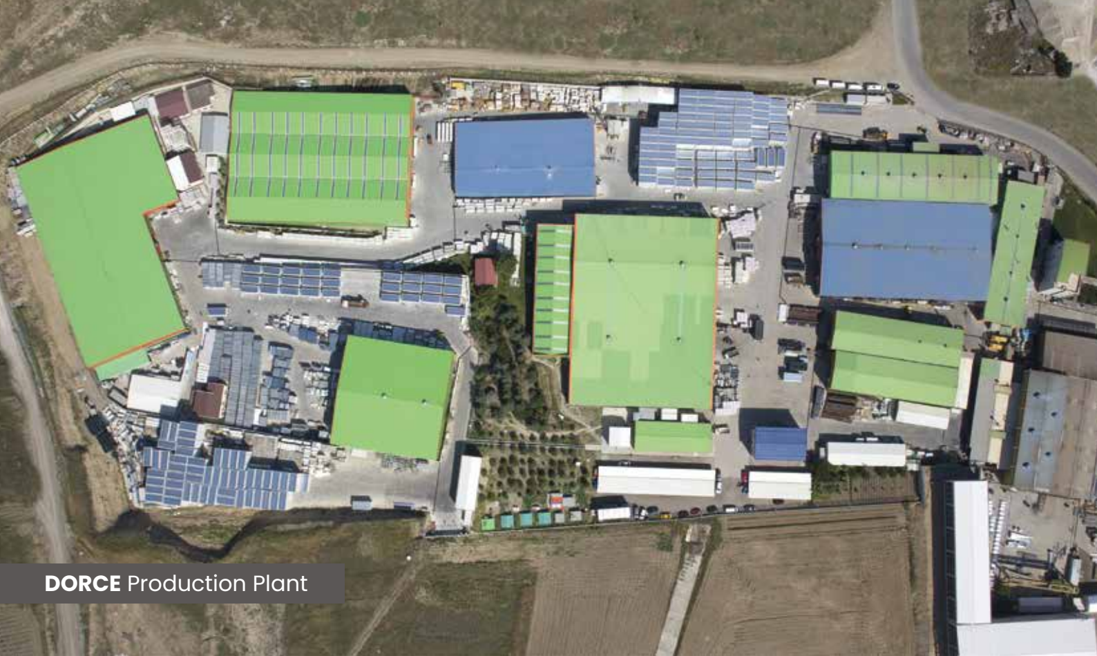
DORCE Production Plant

DORCE completes prefabricated modular steel structures towards meeting all kinds of needs on a turnkey basis in different geographical regions under harsh climatic conditions at the same time with in-house engineering, procurement, production, logistics, assembly, infrastructure and superstructure works, including testing and commissioning.